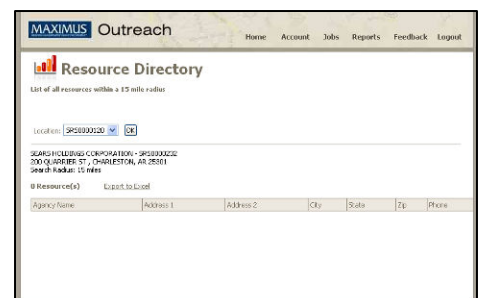
Report of Resource Directory